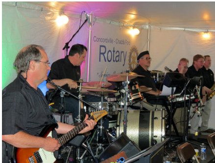
The Strangers entertained the more than 500 people who turned out for this year's 5th annual Twisted Vintner at the Concordville Town Center in Glen Mills.

About 500 people turned out for the 5th annual Twisted Vintner amateur Wine-Making Competition and Wine, Beer and Food-Tasting from local restaurants Thursday, June 4, at the Concordville Town Center at Routes 1 and 322 in Glen Mills. The Concordville-Chadds Ford Rotary Club sponsored the three and one-half hour event which is projected to raise more than $30,000 for the Club's local and international projects. Title sponsor was Garnet Ford followed by Acme Markets, Concordville Subaru, and John Williams Real Estate. Participants included 10 restaurants, three wineries, two breweries and about 30 amateur winemakers. Benefactors include Rachel Kohl Library, Bornelyf special needs camp, Darlington Arts Center, Brandywine Youth Club, scholarships, a school in Haiti, Rotaplast and PolioPlus.