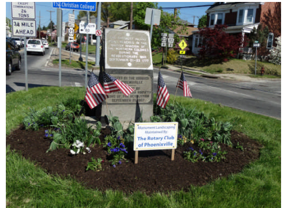
The Rotary Club of Phoenixville maintains the Revolutionary War Memorial at the entrance to the village and was Rotarians were on the job cleaning up the area and sprucing up the gardens as part of 2015 “Rotarians at Work Day” in April. The Revolutionary War Memorial is located at the point which, according to documented history, is the farthest spot the British Army advanced in the Revolutionary War during the battle at Valley Forge.