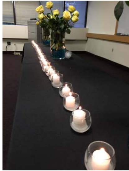
Waiting for Interfaith Service.

Our Rotary District 7450 Conference, "Peace, Projects and Phun", A Celebration of Service, thanks through the combined efforts of all, was truly extraordinary. Substantive programs covered all six areas of focus, local and international, and brought innovative topics and methodology to inspire us as we