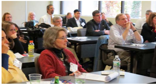
Breakout session Friday afternoon.