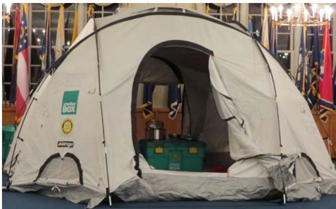
ShelterBox tent which was assembled by RYLA students at 2014 weekend in March.

Each ShelterBox costs $1,000 and requires a multitude of volunteers to assemble and deliver to its destination. Rotary International has been instrumental in the growth and success of the ShelterBox program which was started in 2000. In 2012, ShelterBox became Rotary International's first project partner and the fundraising efforts of Rotarians make up a substantial portion of the donations received by ShelterBox. The Rotary Club of Bensalem plans to raise funds for ShelterBox and volunteer to help the organization.