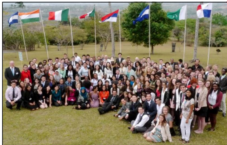
Students from around the world who participated in the University of Peace Model UN Conference in Costa Rica.

"7. Takes into consideration the laws from distinct countries and will not enforce them to follow the suggestions but does encourage them."