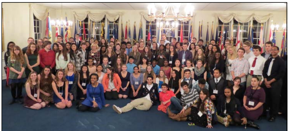
RYLA students, Rotaractors and Rotarians gather for photograph Saturday afternoon at Freedoms Foundation in Valley Forge.