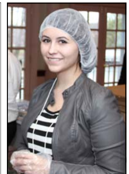
Waiting to start.