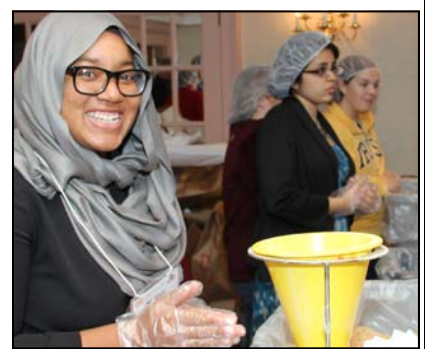
Rotarians refill bins with ingredients and measure ingredients in meal packages.