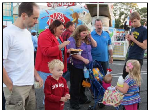
One of the many family groups who enjoyed the 2013 Delco Fair.