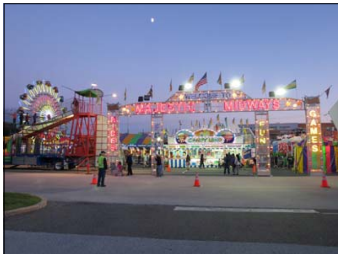
Delco Fair Majestic Midway

When the totals are announced, it is expected that the 2013 Delco Fair will take the total amount raised since 1996 over the $1 million mark. The fair, co-sponsored by Glen Riddle and Concordville-Chadds Ford Rotary Clubs, will benefit CADES (Children and Adult Disability Education Services), Elwyn Institute, Operation Warm, Don Guanella School and scholarships.