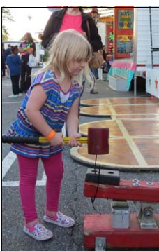
Young lady tries to win a prize by ringing the bell.