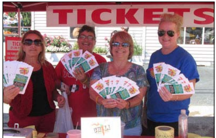
Chester Rotary Club. For additional information, go to the Rotary Club of West Chester website, westchesterrotary.org .