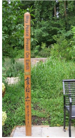
Peace Pole in Sensory Garden in Wynnewood Valley Park.