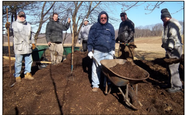
photo shows the workers at the monument. At right is the inscription on the monument.