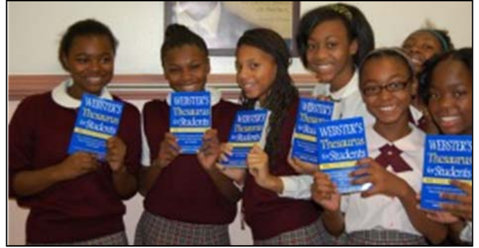
St. Martin de Porres Catholic School students display gift thesauruses from the Rotary Club of Philadelphia.

The Rotary Club of Philadelphia completed distribution of more than 2,000 "gift books" for students at four different schools in October, 2012. During the past five years, Philadelphia Rotarians have given more than 12,000 dictionaries, thesauruses, atlases and library books to school children at more than 20 inner city schools. The annual initiative for the Dictionary Project has become the "signature project" for the Club.