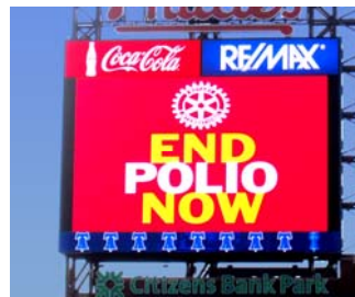
"End Polio Now" is up in lights during ballgame.