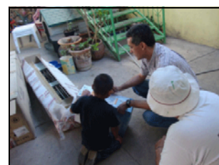
Boy watches unpacking of solar heater in Guadalajara, Mexico.