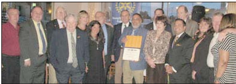
Charter Night celebrated Glen Riddle Rotary Club's 50th year which included presentation of an award of recognition from RI, and recognition of Paul Harris fellows earned by all but the newest member.

Charter Night Celebrating Glen Riddle Rotary Club's 50th year.