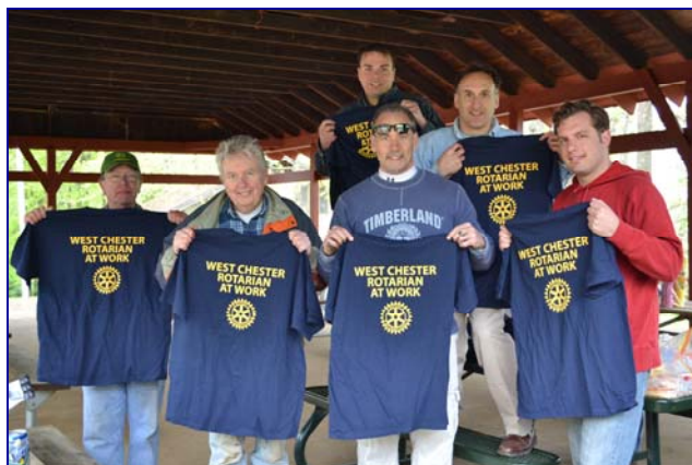
Members of West Chester Rotary Club get ready to don their "Rotarians at Work" shirts and clean up Hoopes Park.

Rotary Club of Philadelphia and the Rotary Club of Eastwick-International Airport joined forces to clean up the Finnegan Playground, Philadelphia's largest, on "Rotarians at Work" Day.