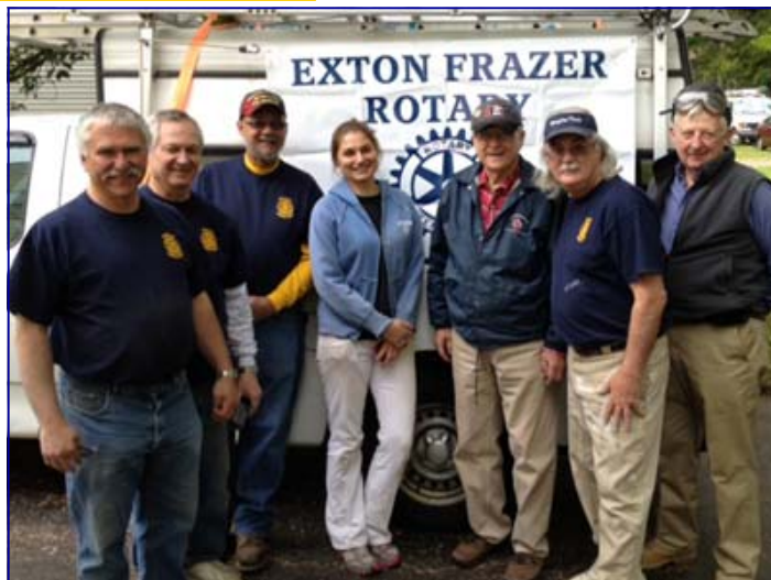
Great Valley/Exton Frazer Rotarians spent Saturday morning doing home repairs for people unable to do them.