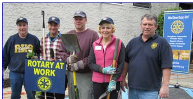
Glen Mills-Thornbury Rotarians are ready to begin planting at the Media State Police Barracks.

For more, check the website www.Rotary7450.org and look for the next Leader issue