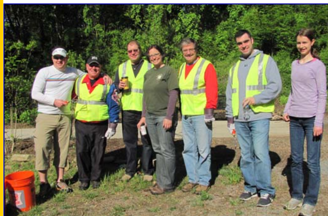
Early team of Ardmore Rotarians gets ready to do some spring cleaning at the Sensory Garden in Wynnewood Valley Park Saturday morning.

Broomall Rotary Club team undertook the cleanup of the grounds at 1696 Thomas Massey House. The Club was among 42 out of the 53 Rotary Clubs in District 7459 to tackle a variety of projects April 28.