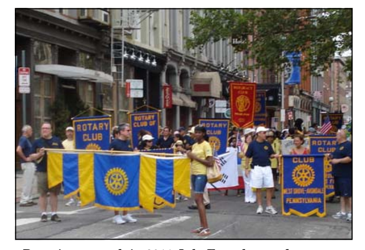
Rotarians march in 2011 July Fourth parade.

Each Rotary Club is asked to make plans now to send a small delegation, including family members, with the Club banner to march in the parade to celebrate Rotary. More details later.