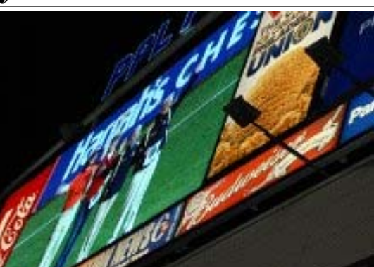
Giant "jumbotron" video at half-time reports that Rotary is working to "End Polio Now."