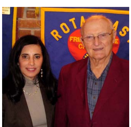
service