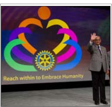
2011-12 RI theme during the