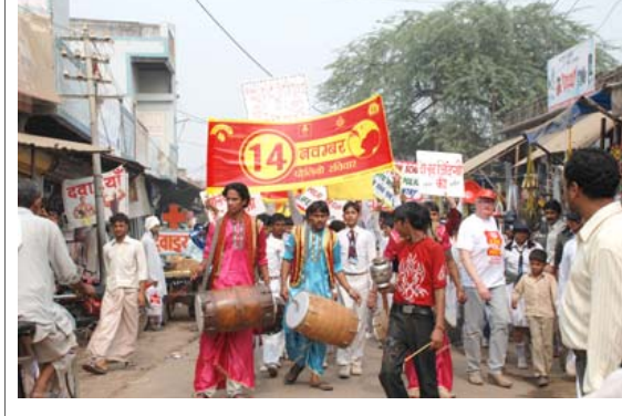
Parade of local and international Rotarians announced Polio Immunization Day November 14.

The trip was from November 11 to 23 and team members had the opportunity to visit a shelter, supported in part by Rotary Clubs of West Chester Downtown and Exton-Frazer, as well as do some sightseeing while in India. Team members