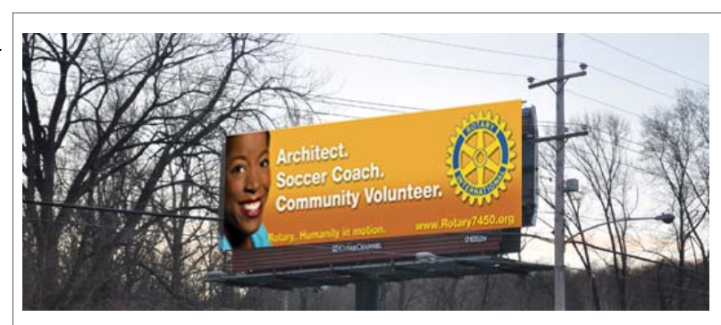
Rotary billboard faces north on Route 252 south in Paoli.

"Our District 7450 project involves the use of colorful but simple billboard ads using Rotary International Humanity in