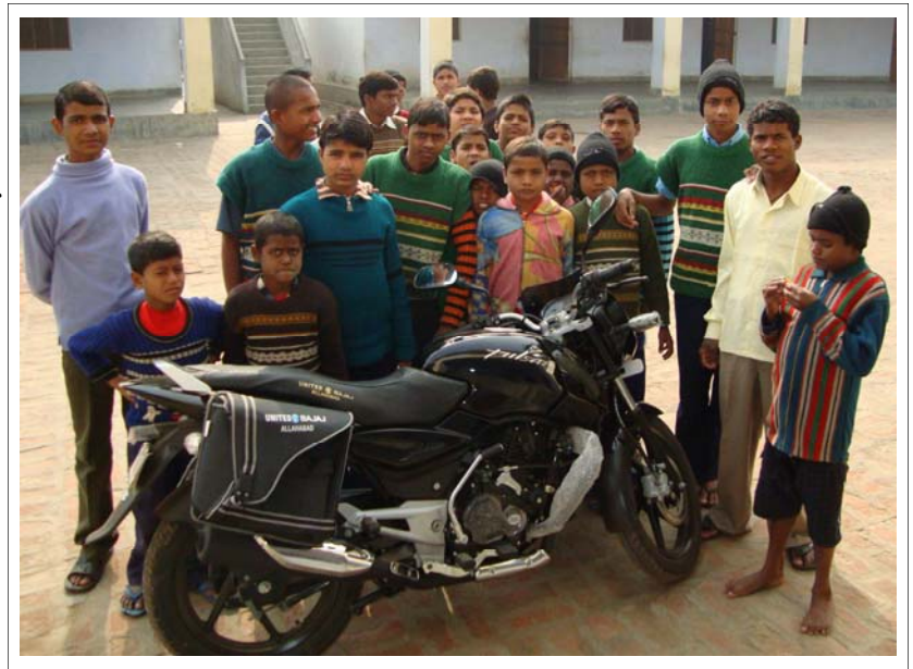
Former child-slaves gather around a motorbike provided bike, helmet and accessories. It was the first by West Chester Downtown "Fridays" and Rotary Clubs project undertaken by the newly forming Norwich-St. Edmunds (England), at Bal Vikas Ashram in

Bal Vikas Ashram (BVA) is a child-slave rehabilitation center near Allahabad, India, that has served more than 450 children since the year 2000. During their recovery and rehabilitation at the center, boys receive medical and psychological treatment. They also receive education—general literacy,