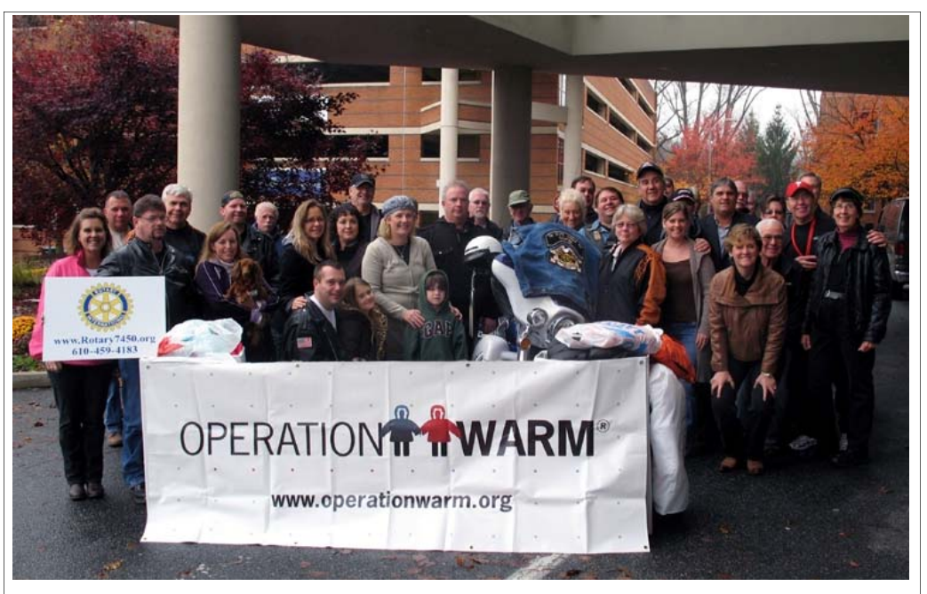
Bikers in Delaware County rode into Riddle Memorial Hospital parking lot Saturday afternoon with new winter coats which they donated to Operation Warm program. Riddle Memorial Hospital hosts the collection which is coordinated by Glen Riddle Rotary Club.

Rotary Clubs across the country have found that Operation Warm offers an easy to execute Community Service Project with a great bang for the buck. Clubs identify a local service agency supporting kids living in need (Operation Warm can help clubs locate agencies which will identify need), establish a goal for how many coats the Rotary Club would like to provide, sponsor fund-raising activi-