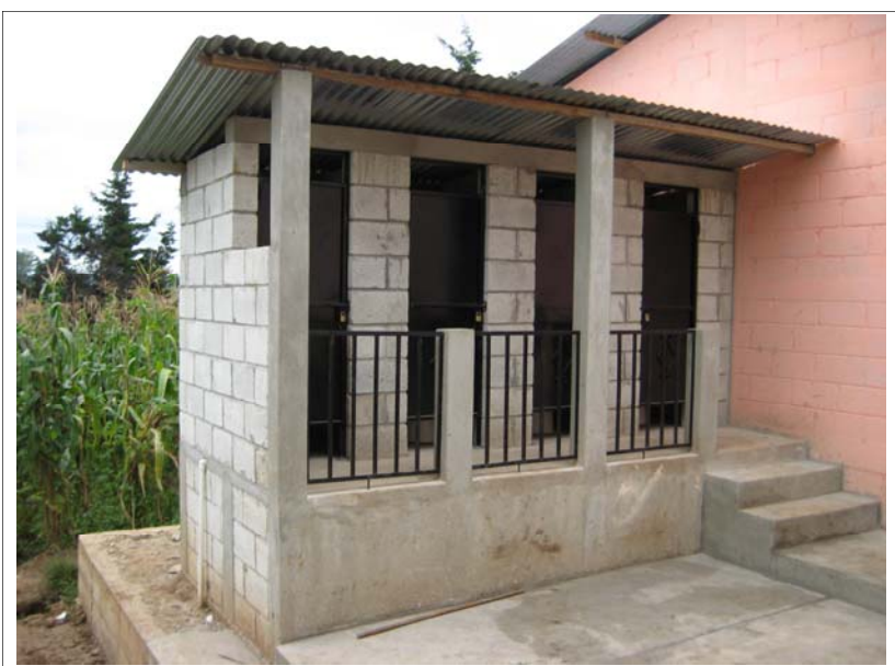
One of the sanitation stations at school in San Antonio Ilotenango, Guatemala.

Ardmore Rotary Club contributed $12,000 and Rotaract of Main Line raised $5,000 for the project to date.