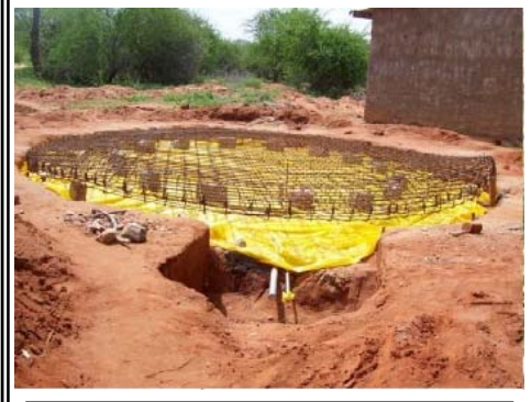
Workers are laying foundation for the first collection tank.