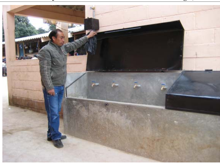
Drinking water station at school in San Antonio Ilotenango, Guatemala.