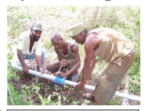
GI pipes have been laid for 500 meters to the first completed collection tank.

Phase one of West Chester Rotary Club's $327,567 multi-phase six-year effort to assist the people of Ukambani, Kenya in partnership with the South Nairobi Rotary Club is supplying clean water to Ukambani, Kenya.