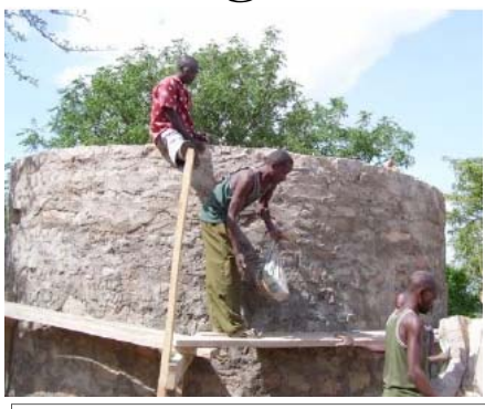
Workers check finished first collection tank already holding water.