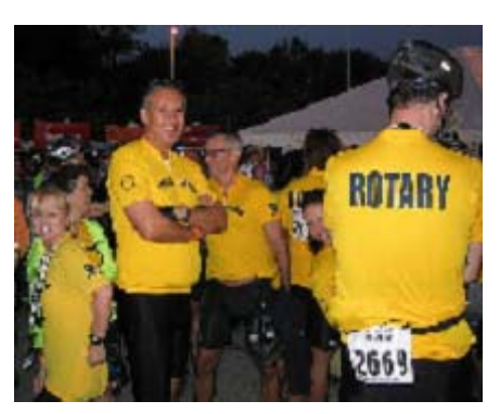
Philadelphia Cycle Team members wore jerseys with "Rotary" on the back.

made the ride, the Philadelphia Rotary Team has raised over $300,000 for MS research.