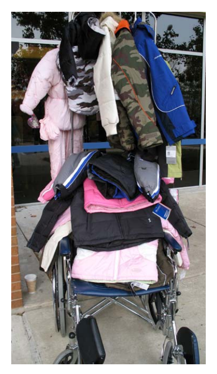
Some of coats donated to Operation Warm at Riddle Memorial Hospital event.

Delaware County's signature event to provide 5,000 children with new winter coats has been proving to be something people can feel good about. Individuals