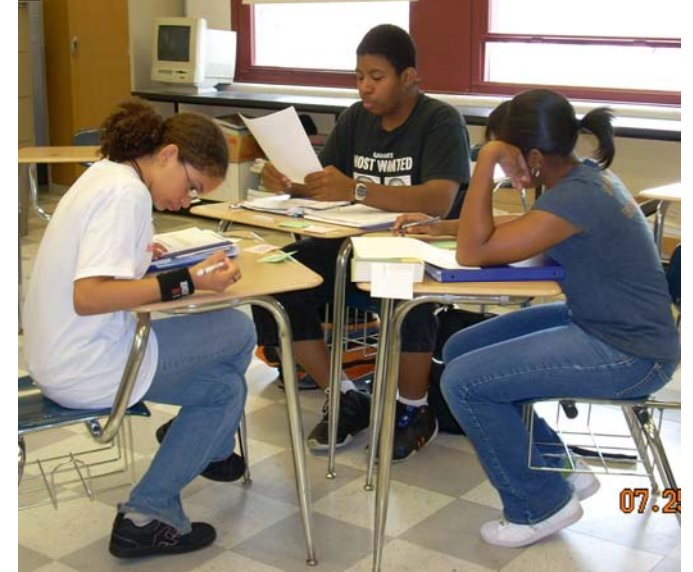
Three of 25 students in the Philadelphia Writing Project work on their creative writing skills.

This pilot program enrolled students 25 from all around Philadelphia and classes were held at the High School for the Creative and Performing Arts. which donated classroom space and the use of its computer lab. The pupils were challenged to write and share poetry, research and create Op Ed pieces, and generate autobiographical and memoir materials. There was a great deal of editing and rewriting