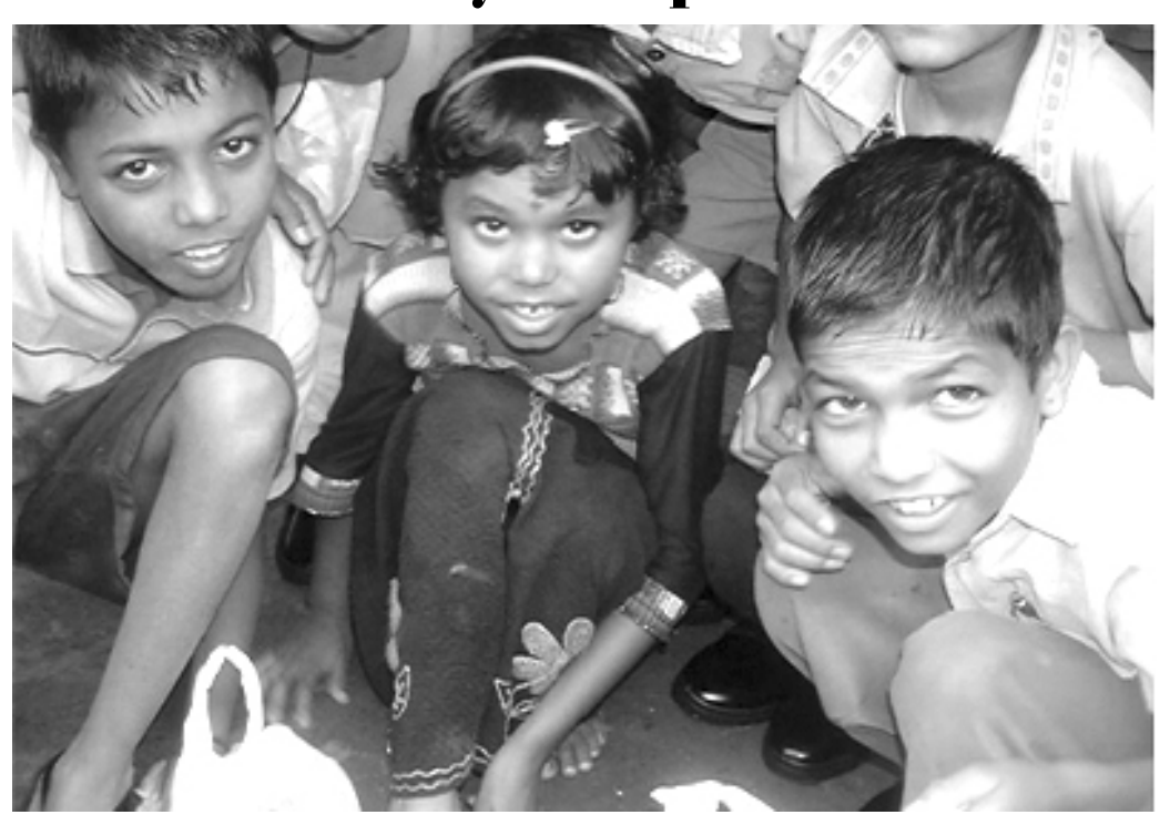
School students in Nashik, India are all smiles after receiving shoes provided by Bristol Rotary Club which also provided 450 books and 10 computers to 10 village schools near Nashik.