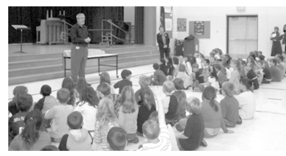
Downingtown Rotary Club (above left) presented dictionaries to third-graders at West Bradford Elementary School in Downingtown. The books contain Four Way Test Labels to encourage