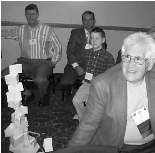
Rotarians were challenged to build a paper tower in 15 minutes using tape and index cards (lower right). Some towers stood tall (left and above) and some did not (upper right).