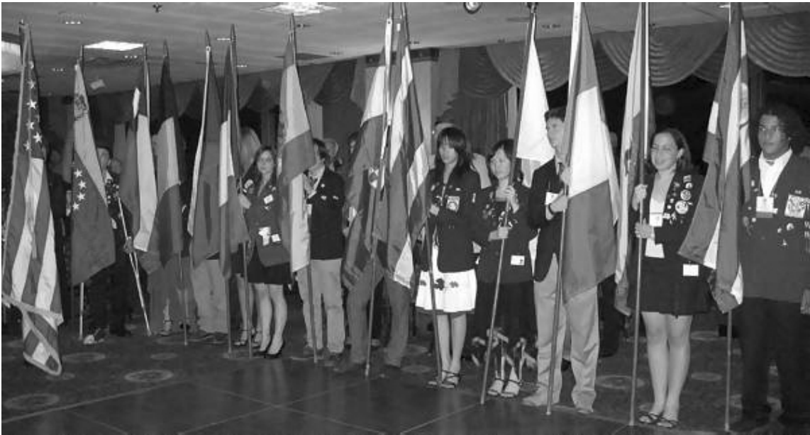
15 Rotary exchange students presented the flags of their respective countries at the Saturday night dinner at the District 7450 Conference in Atlantic City.