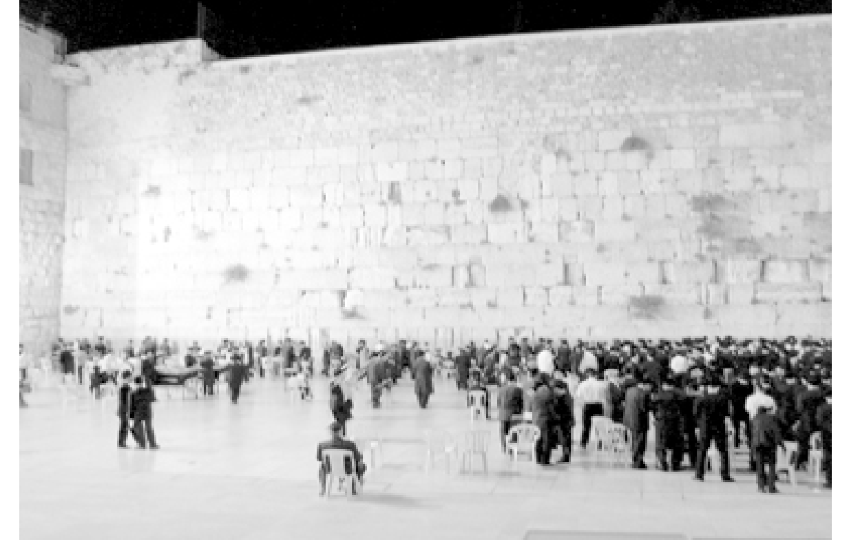
Among the places visited by the District 7450 GSE team during it's month in Israel was Kotel or the Western Wall or the Wailing Wall one night .

The District Conference was held at Club Hotel Eliat and had an outstanding 700 people in attendance. There was entertainment, lots of Rotary business, and a lot of socializing. Many people were anxious to meet and greet our team because eventually we were supposed to come to their town and they were going to be our host. This was their first opportunity to meet us face to face. So many faces to remember, but by the end of the GSE program in Israel, we knew them all. The conference was mostly conducted in Hebrew, so for us, it was difficult to stay focused. Since English is spoken, as well as Hebrew in Israel, we were not required to take an emersions course in Hebrew.